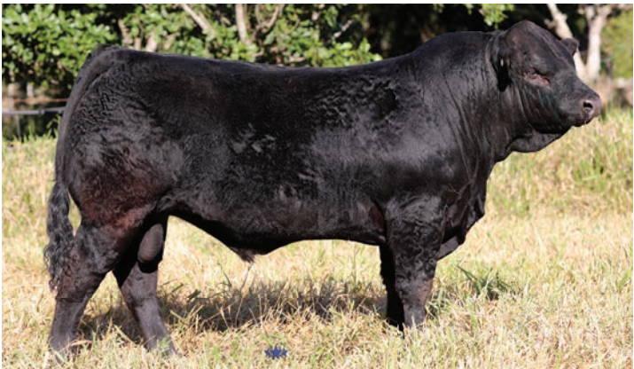
OAKWOOD TRU KNOWLEDGE