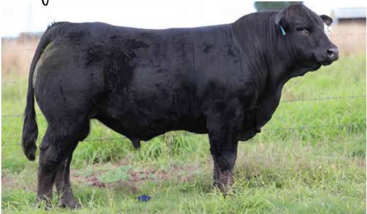
ULSTER 1 RAIN MAN