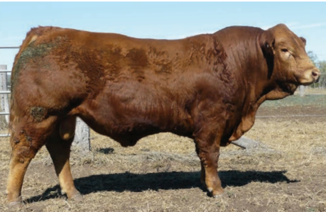
ULSTER 1 PRIME MOVER