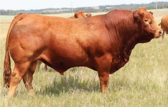
RICHMOND GRID IRON